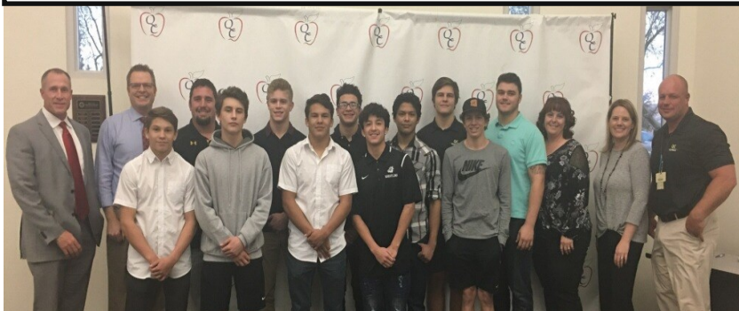
QCUSD Governing Board recognized our Queen Creek High state champion wrestlers!