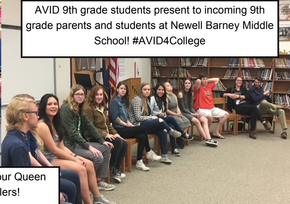
AVID 9th grade students present to incoming 9th grade parents and students at Newell Barney Middle School! #AVID4College