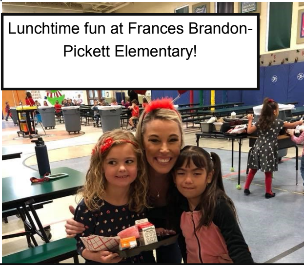
Lunchtime fun at Frances Brandon-Pickett Elementary!